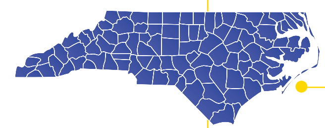
100 (i.e. all!) N.C. counties served by Foundation programs