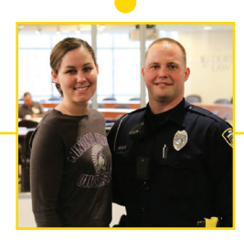
Including 289 first responders served (through Wills for Heroes)

1,297 Attorney, paralegal and law student volunteers engaged (across all programs)