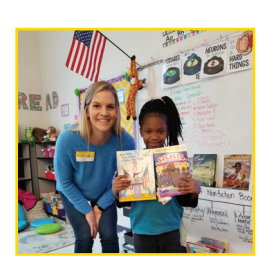
PAGE 12 LAWYERS FOR LITERACY