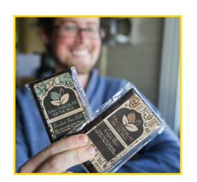
PAGE 8 NC LEAP